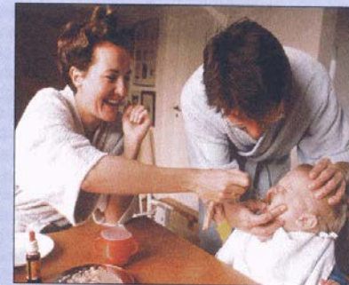
Ready subjects. Denmark's 18-month-long birth cohort survey will collect data from mothers and newborns for a new database.