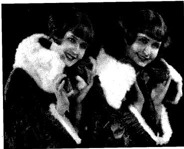
Beauty in numbers. These Danish twins starred in a variety show at the turn of the 20th century; now it's their medical records, part of a database, that are in demand.

digit personal identification number, called the CPR, that follows each Dane from cradle to grave. According to Melbye, "our registers allow for instant, large cohort studies that are impossible in most countries."