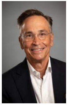
John Ward Task Force