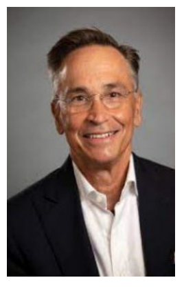
John Ward Task Force