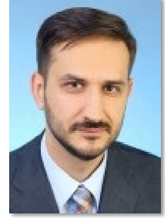
Vladimir Chulanov Russia